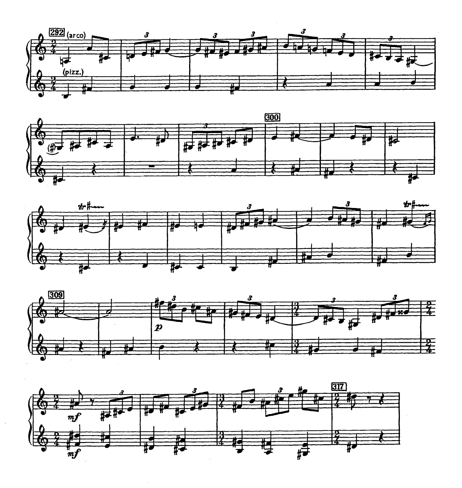
Reprinted by permission of Boosey & Hawkes, Inc., for the Dallas Symphony Orchestra violin auditions