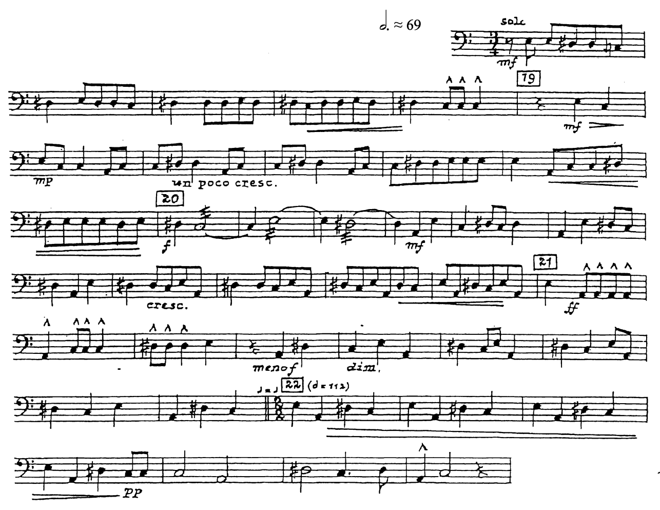
Reprinted by permission of the publisher